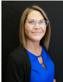
ECONOMIC DEVELOPMENT SPECIALIST