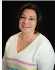
ECONOMIC DEVELOPMENT SPECIALIST