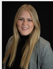
ECONOMIC DEVELOPMENT SPECIALIST