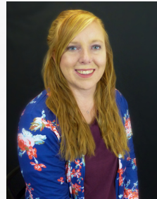
ECONOMIC DEVELOPMENT SPECIALIST